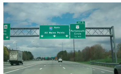
WE GET TO SEE A LOT OF INTERESTING SIGNS. :)

During most of March and April we continued to visit churches close to home, in the states of SD and NE. It was a special blessing to spend time with family and long-time family friends of my parents and grandparents at various churches along the way. We appreciated the flexibility of many pastors which allowed us to schedule our meetings in an efficient manner, saving on time and money. At the end of April we traveled to WI for our first missions conference and a meeting, and then to conferences in TN and ME. We also stopped through at a church in Indiana, but because I failed to take note of the time change we were an hour late! The pastor kindly let me tell about our ministry anyway, and even took up a love offering for us.